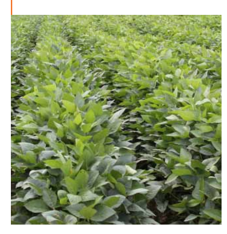
SGS provides a wide range of speciality services.